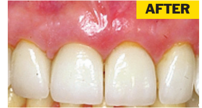
AFTER New technique repairs gums quickly with great results

A DENTAL breakthrough can correct receding gums without painful cutting and stitches – or the need to take time off from work for a recovery.